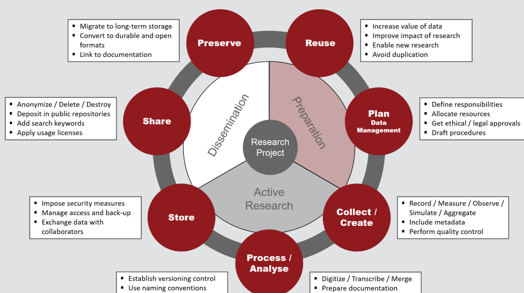
FIGURE 1. THE RESEARCH DATA LIFECYCLE, ILLUSTRATING DIFFERENT ASPECTS OF RESEARCH DATA MANAGEMENT THROUGHOUT THE COURSE OF A RESEARCH PROJECT

In the rest of this chapter, we will take a closer look at some of the main actions taken to manage research data. The chapter is structured according to the ‘research data lifecycle’, which illustrates the typical phases of a research project, shown below in Figure 1. In short, we will discuss how to best plan your research data management, how to collect, process, store and secure your research data during the active phase of the research project, whether and how to share your data with others after your project has concluded, what to consider when preserving research data, and what documentation to generate and maintain along the way. The aim of this chapter is to outline general norms of good research data management and to discuss the ways in which these norms can be implemented across disciplines.